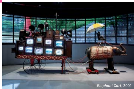
Elephant Cart, 2001

Nam June Paik Art Center houses 248 pieces of video installations as well as drawings of Nam June Paik's and other contemporary artists. There are also Nam June Paik archives including 2,285 pieces of videos and other primary materials. The Nam June Paik Art Center collection forms the basis for critical research and curatorial practice.