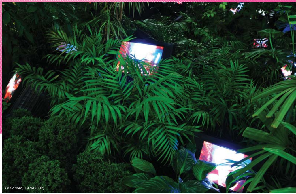
TV Garden, 1974(2002)

Taking up Paik's artistic legacies, Nam June Paik Art Center aims to make exhibitions receptive to new discourses, breaking away from the modern notion of art and widening the possibilities of information and communication in a media age. Continuous research is conducted on Paik's creativity, which forms the basis for Paik exhibitions and also for different exhibitions to expand his artistic views into the future.