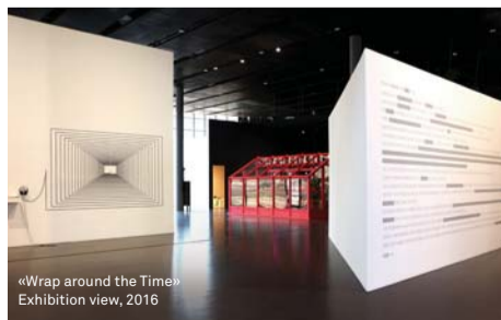
«Wrap around the Time» Exhibition view, 2016